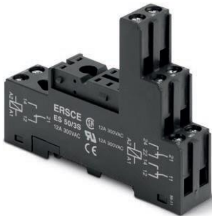
Dimensions Measures in (mm)

RoHS compliant (Directive 2011/65/EU and Delegated Directive 2015/863)