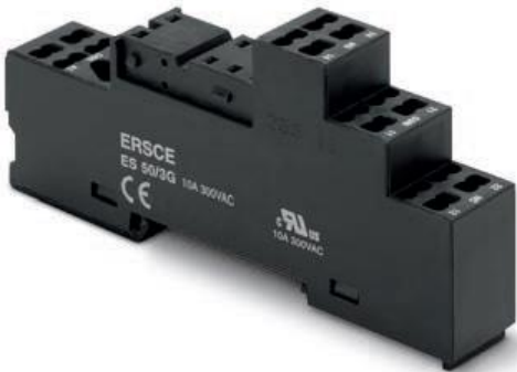
Dimensions Measures in (mm)